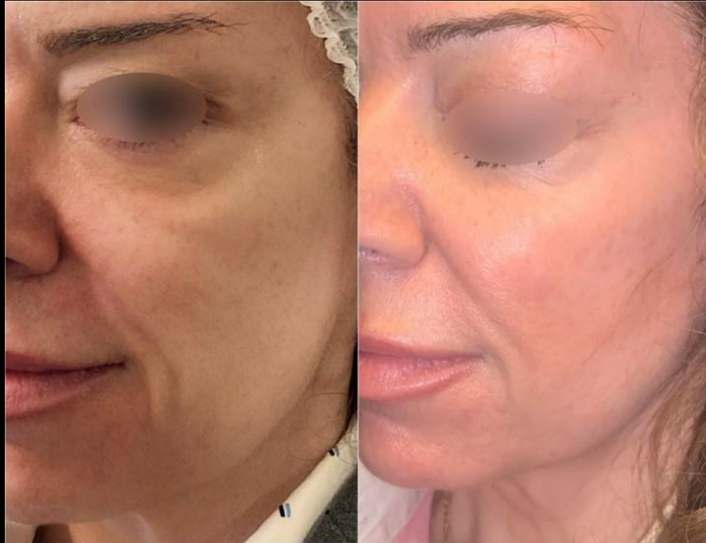
2 weeks after 1 session