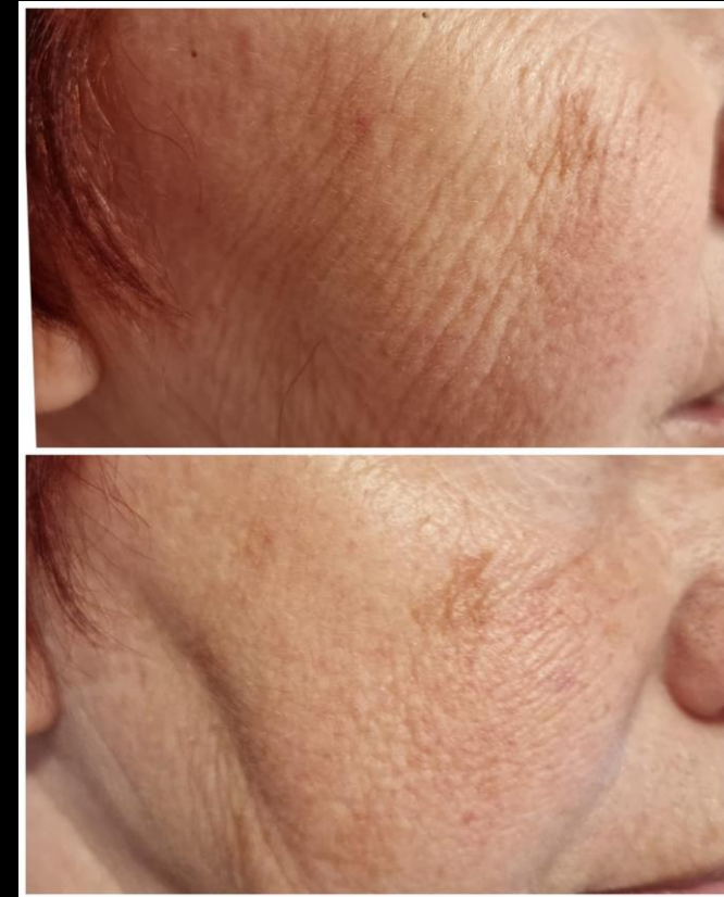
3 weeks after 1 session